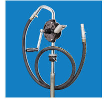
H-6502 FM Approved Rotary Drum Pump