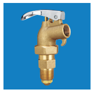
H-4934 Brass Drum Faucet 3/4" Opening