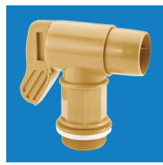
H-2956 Plastic Drum Faucet 2" Opening