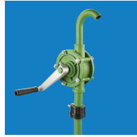
H-4377 Plastic Rotary Drum Pump