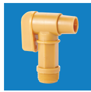
H-2955 Plastic Drum Faucet 3/4" Opening