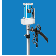
H-4933-C Standard Electric Drum Pump