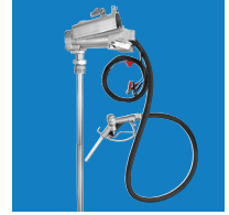
H-7193 Fuel Transfer Pump