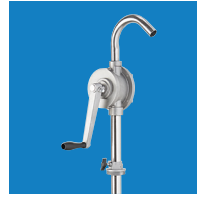
H-5647 Stainless Steel Rotary Drum Pump