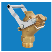
H-4935 Brass Gate Valve 2" Opening