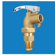
H-4934 Brass Drum Faucet 3/4" Opening