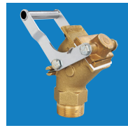
H-4935 Brass Gate Valve 2" Opening