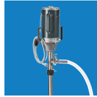
H-6501 High Viscosity Electric Drum Pump